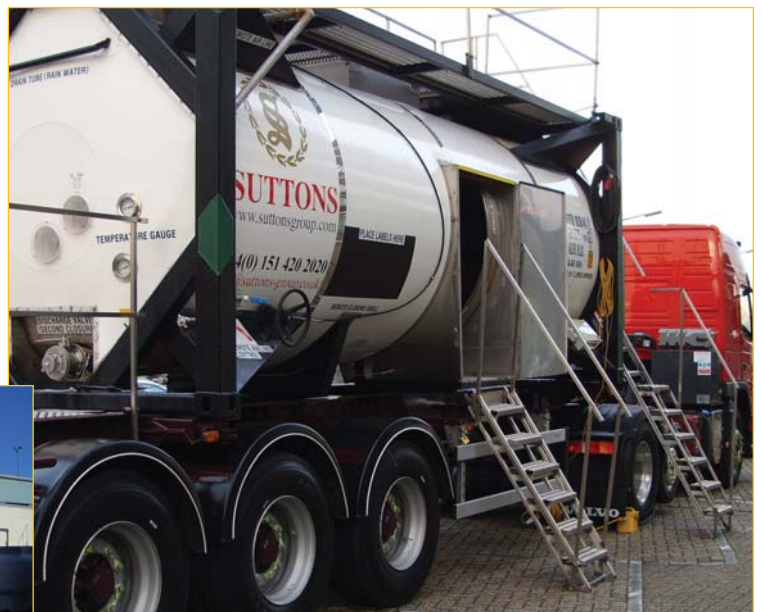
The fully interactive demo tank allows visitors to go inside and climb on top to see the technology used on a tank container.