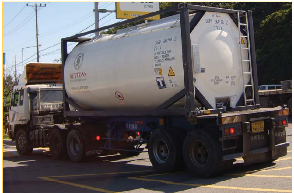
SUTU 2641982 delivering in Busan, Korea.